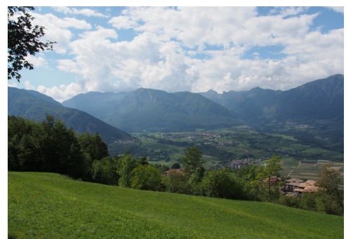
View of the valley on the footpath to Naone

The employment and implementation of organic-ecological cultivation led to the agricultural land in the neighbourhood of Lundo being gradually converted to organic-ecological farming by its owners. This is an example of how an ideal can be started by a few people and spread to the surrounding area.