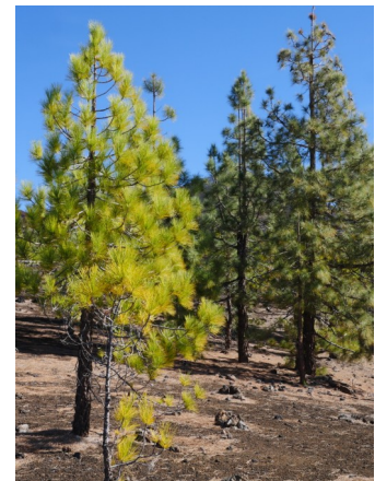
Canary Island pine Teide National Park, Tenerife

These and other exercises are trained on the cultural and hiking days and in the study programmes. In this way persons exercise the practical application of the content and values so that they are easier to implement in everyday life at home.